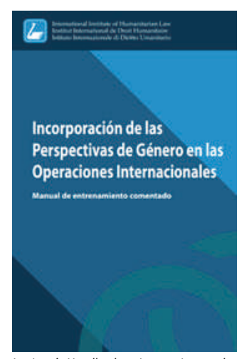
Institute's Handbook on integrating gender perspectives into international operations

Online Workshop on "Incorporación de la perspectiva de género a situaciones de conflicto armado interno, otras situaciones de violencia y post conflict"