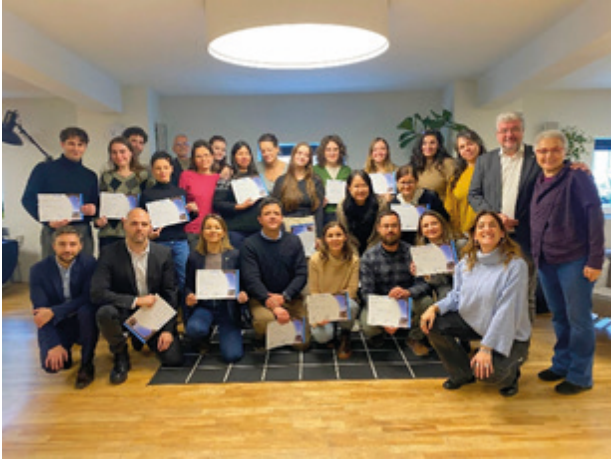
Tailored Training on Advocacy for Protection for UNHCR Partner Organizations (Bulgaria) 5 th – 6 th December 2024

analysis tools, and phases of advocacy strategies. Participants learned best practices for stakeholder mapping, power mapping, crafting compelling messages, and developing monitoring and evaluation mechanisms to measure and refine advocacy efforts.